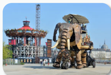
The Grand Elephant, Nantes, © Jean-Dominique Billaud

Nantes is a major European metropolis that offers a dynamic blend of innovation, accessibility, and cultural appeal. At the heart of a university research hub with over 40,000 students, and strong academic sectors in healthcare and engineering, the city offers a well-connected transportation network that facilitates travel for both domestic and international visitors. Nantes offers an inspiring setting that encourages both productive work and networking with a strong motivation to promote sustainable development. La Cité Nantes Congress Centre, in the heart of the city centre opposite the railway station, is within walking distance of high quality, affordable hotels and public transport.