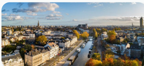
Bords de l'Erdre, Île Versailles, Nantes